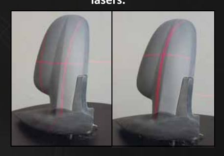
Measurement volume positioning lasers.

Scan3D DUAL VOLUME is precise non-contact measurement device which thanks to the latest LED light technology and GigaBit Ethernet communication, enables rapid execution of complex measurements. As a professional tool for metrology each 3D scanner is certified according to VDI / VDE 2634 standarts and it's accuracy can be confirmed by independent accredited metrology lab with adequate certyficate. Scan3D DUAL VOLUME has two independent measurement volumes featuring different work space, accuracy and measurement resolution. Large volume allows automated measurement of overall dimensions using markers for merging single shots. On the other hand, small volume allows precise measuremnts of smalles details such as threads and in high-resolution mode (up to 1500 points/mm2).