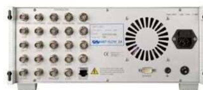
UVP-DUO-MX rear panel